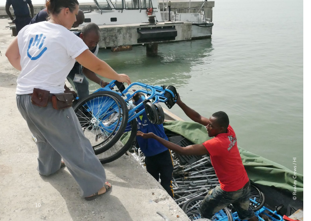
Photo: An HI team unloads wheelchairs, crutches and walkers from a boat in Les the earthquake in August 2021.

We are now seeing the government start to make new funding available again and we are hopeful about rebuilding in the months ahead.