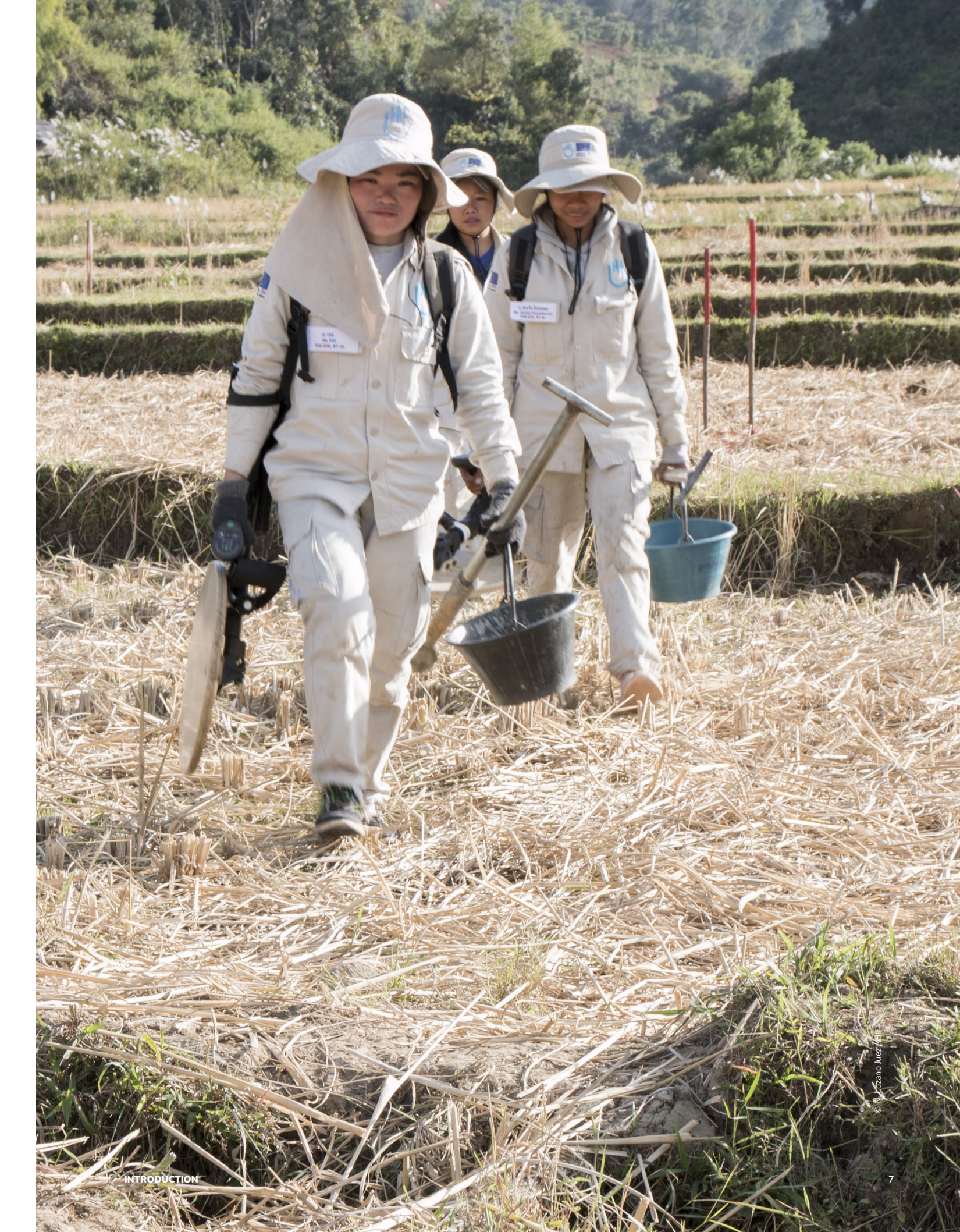
Photo: HI deminers carry metal detectors across a clearance site in Laos.