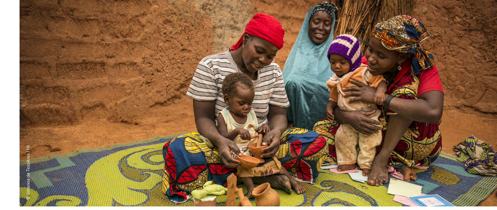
Photo: Mothers use handmade toys to stimulate their children as part of a project in Niger to help children with malnutrition develop.