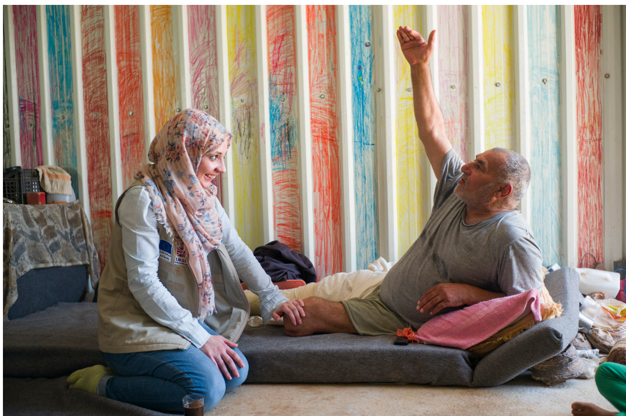
Rajab 9 , 63, suffered severe injuries in both legs when his house was bombed in Syria, in 2013.

Following an amputation, it is crucial for the person to consult with specialists and gain the support of their peers and family so they can learn to accept the consequences of the loss of a limb (pain, phantom pain, reduced muscular strength and independent ambulation perimeters). Moreover, the person will need lifelong follow-up and periodic maintenance of their prosthetic limb(s), as such items need to be replaced or repaired every three to five years for adults, and up to twice a year for children.